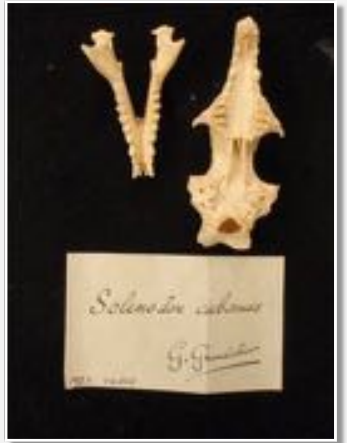
The solenodon, a Eulipotyphlan, is considered a "living fossil", and its continued survival represents the conservation of over 50 million years of unique evolutionary history.

fications of human arrival in the Caribbean, distinguishing the impacts of Archaic, Ceramic, and European cultures. This analysis identified the selective loss of large- and small-bodied mammal species, with only medium-sized species alive Hispaniolan Solenodon, Solenodon paradoxus, to understand what traits promoted its persistence in the past and its survival in the present.